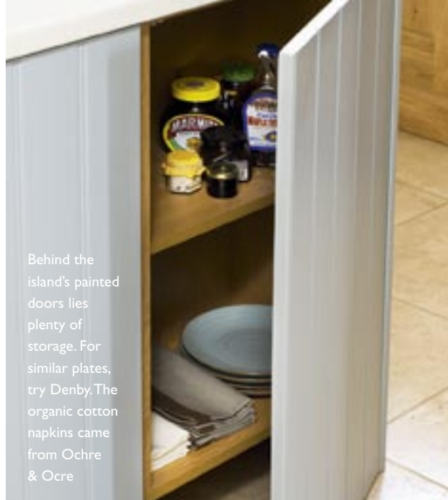
Behind the island's painted doors lies plenty of storage. For similar plates, try Denby. The organic cotton napkins came from Ochre & Ocre